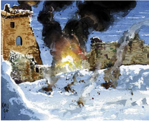
Word of Blasting

"Eenie, meenie, minie, moe . . . oh, why not all of them?" —Jaya Ballard, Task Mage